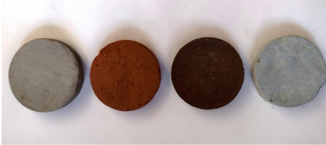
Fig.1. Absorber sample from Right to left: Cement-Red soil-Loamy soil-clayey soil

A Strontium 90 has been used as continuous beta radiation source with intensity maximum at about 0.546 MeV and maximum electron energy of 2.2 MeV. The Geiger Miller counter tube instrument used for the measurement was supplied by the Nucleonix systems Pvt. Ltd., Hyderabad [6]. An experimental arrangement is sketched in Figure 2.